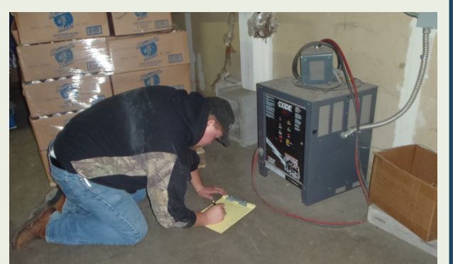
Mid Michigan Community Action's Weatherization Energy Auditors complete a full pre-inspection on each home to determine which energy saving measures are applicable.

Implementation of multi-unit Weatherization--keeping hundreds of housing units affordable and energy efficient