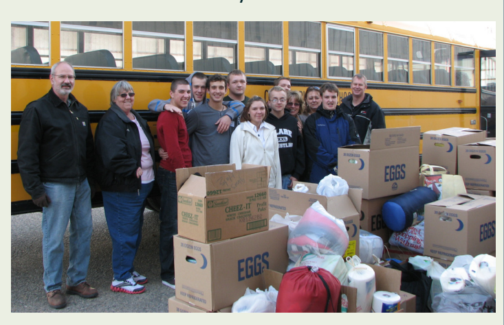
Food Warehouse staff accept $3,500 in food and personal needs items from a Clare High School class project.